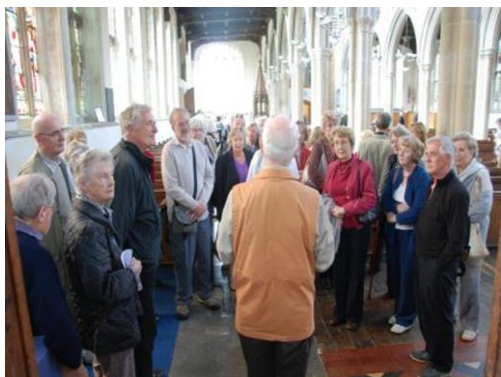
Visit to Suffolk 2011 – Long Melford Church