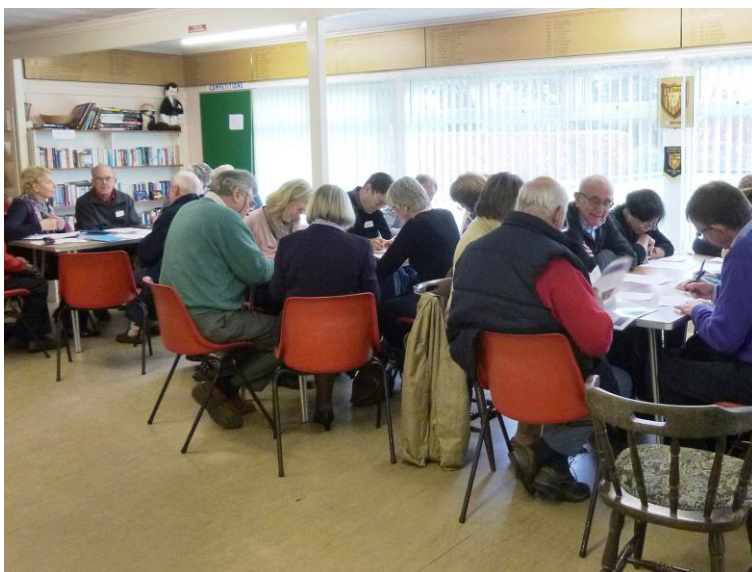
New Members' Coffee Morning November 2013