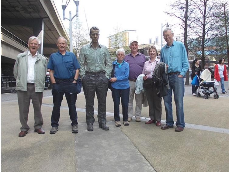
London Studies Group with a "new recruit"