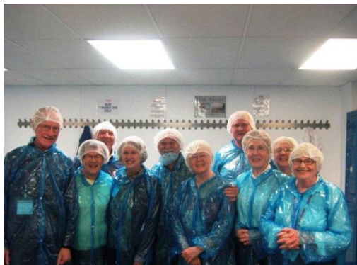
New recruits to the COOK Food Factory in Sittingbourne 2013

The Committee also organises two or three outings each year. The focus here is on scientific and engineering topics which are best