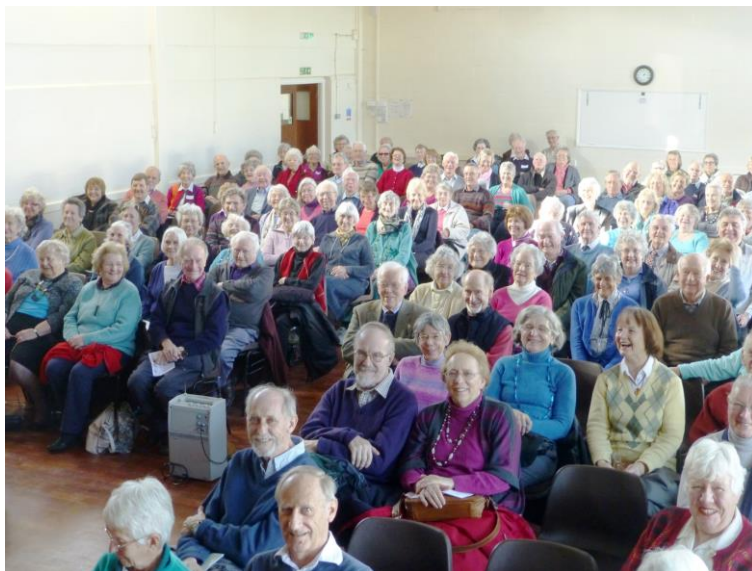
General Meeting in the Sevenoaks Community Centre