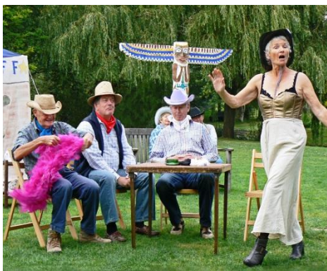
"Hoedown at Cricketts Creek"