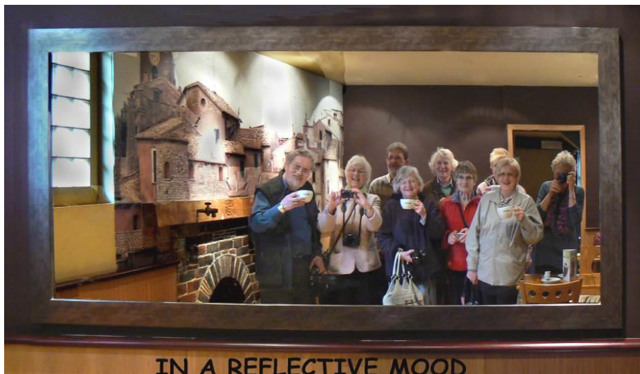
IN A REFLECTIVE MOOD "In a reflective mood"- Photography Group