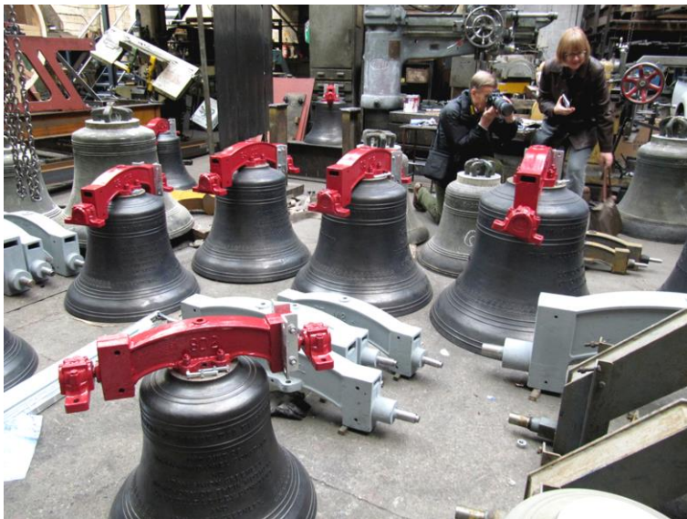
Inspecting the Jubilee bells at