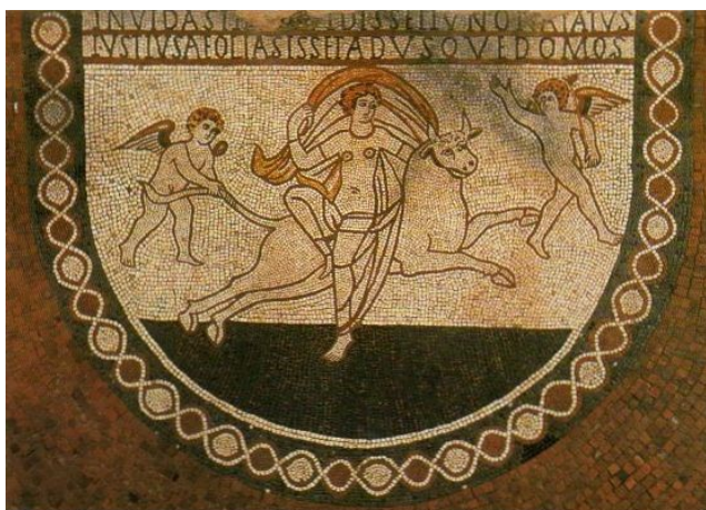
The Abduction of Europa mosaic at Lullingstone Villa