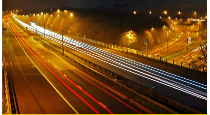
Chevening Interchange - from Rob Weighill