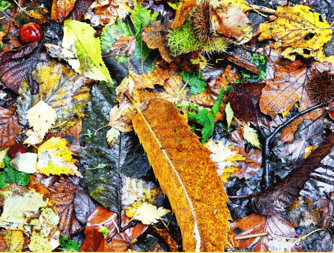
Autumn Tapestry - from Celia Smith

All the photographs were taken by members of the group during lockdown.