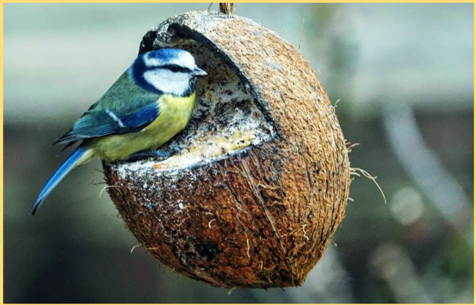
Blue Tit