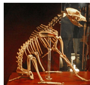
"Hatch" the dog