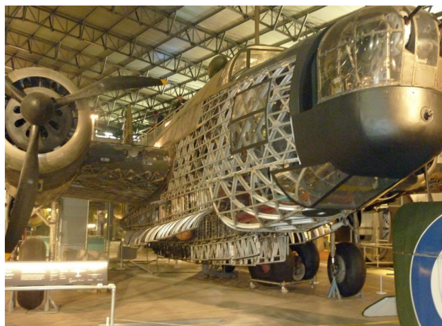
The iconic Vickers Wellington bomber

In July several members enjoyed a visit to the Brooklands Aviation & Transport Museum situated at Weybridge in Surrey, on the site of the old Brooklands motor racing track and the Vickers Armstrong aircraft factory. The museum is well served by a large team of volunteer guides and houses a large collection of motor vehicles, including bikes, cars, and buses. On the aviation side most of the exhibits are of Vickers' aircraft, all well preserved and presented. There are several outdoor exhibits, examination of which, for us, was limited somewhat by persistent rain.